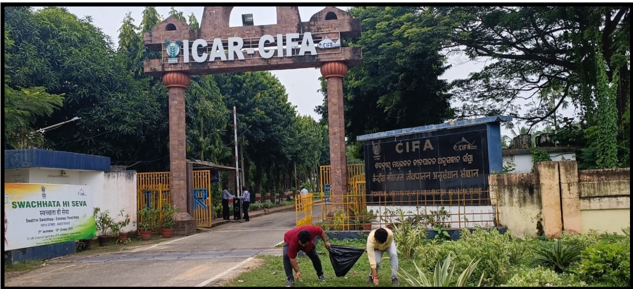
Active participation from the employees