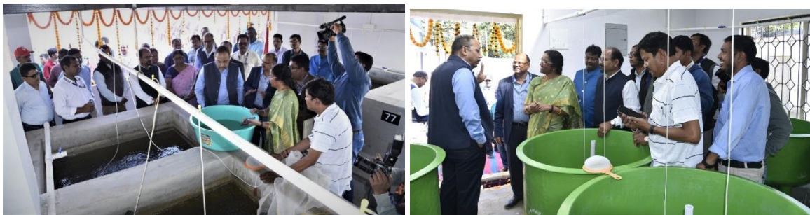
Fig 3 Secretary, DoF, GoI interacting with the Director ICAR-CIFA and CIFA-GI Scampi team

The secretary appreciated the facilities created at ICAR-CIFA and advised the scientists to give emphasis on the cost reduction of farming for the benefit of scampi farmers. He further stressed the need to have more focus on the creation of infrastructure for frozen storage of scampi and create awareness among the consumers on the superior quality of frozen products.