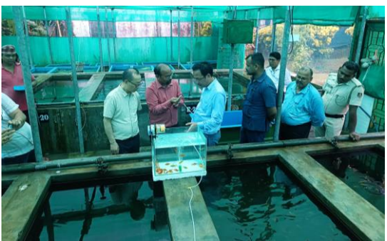
Visit of Hon'ble Minister to Scampi Hatchery Unit