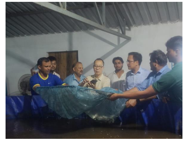
Visit of Hon'ble Minister to Biofloc Unit