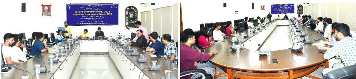
Figure 3-4 Images of the debate competition held on 29 October 2024

A debate competition on the “Technology and Digital Transparency are the only ways to reduce corruption in public organizations’ and a Quiz competition on vigilance related matters was organized on 29 October for the staff of ICAR-CIFA.