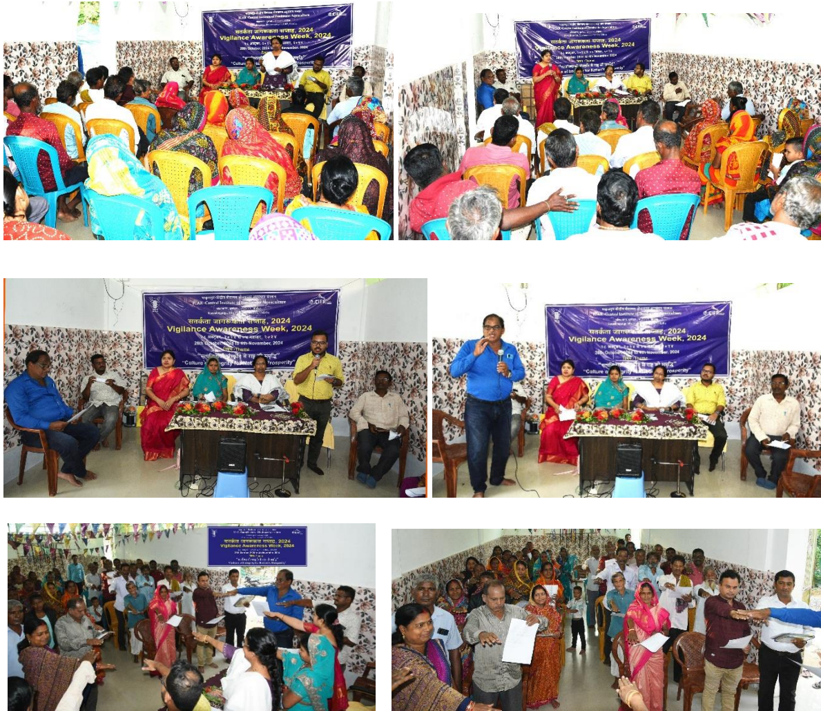
Figure 7-12 Images of Gram Sabha held at Rajas Gram Panchayat on 4 November 2024.